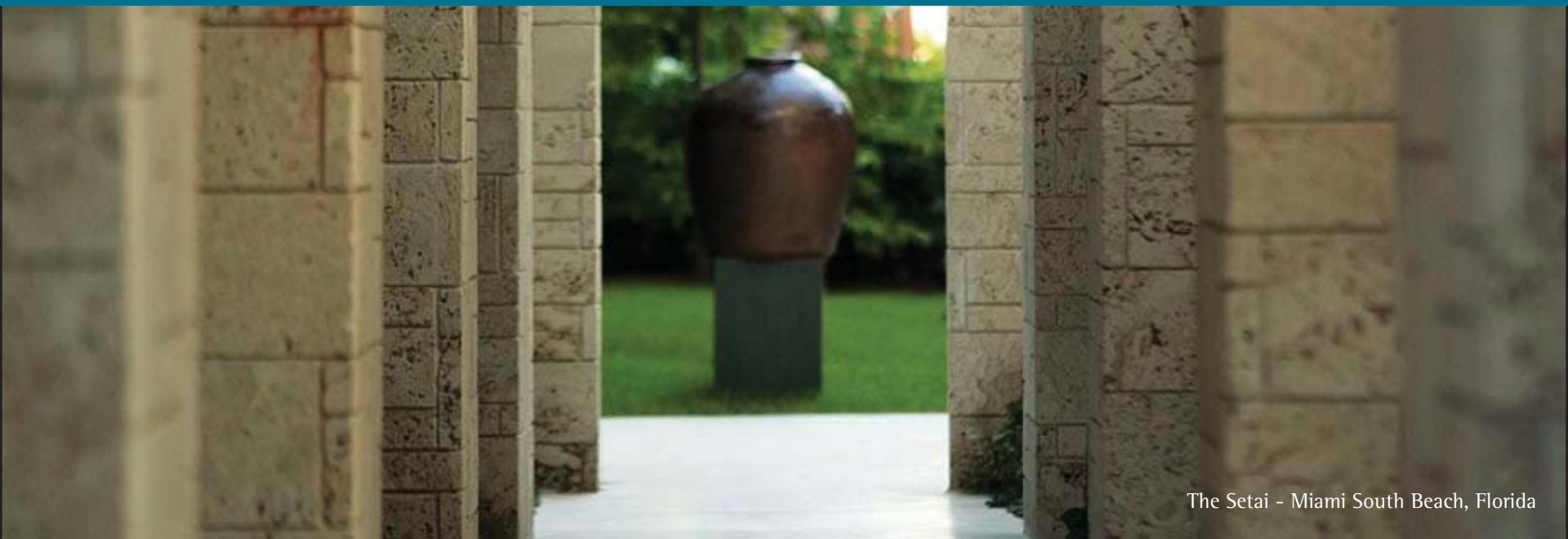
The Setai – Miami South Beach, Florida

Conde Nast Traveler acknowledged The Setai on “The Gold List” in both US and UK, “Readers’ Choice Awards Best in the World”, as well as the “Top 50 Hotel Spas in the US”. Travel & Leisure, The World’s Best List #9 Large City Hotel in US/Canada”, along with the Conde Nast Johansens Awards for the “Most Excellent Hotel in the USA & Canada”. www.thesetaihotel.com