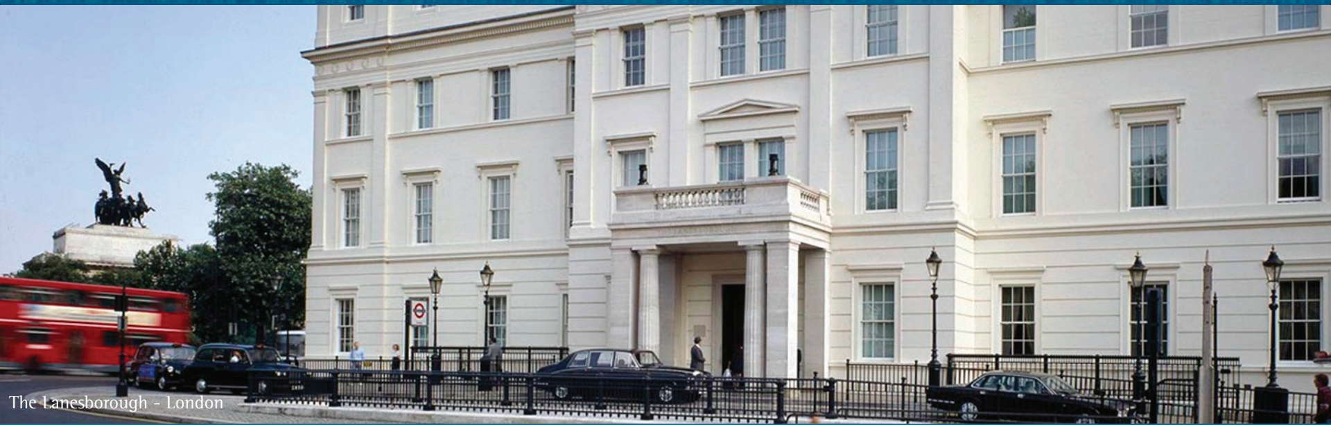
The Lanesborough - London