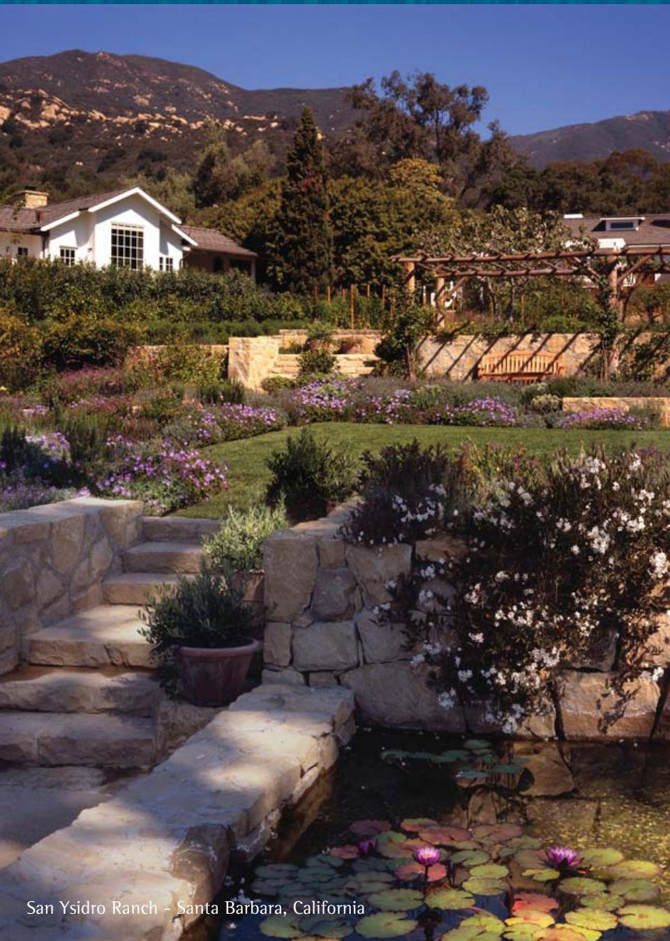
San Ysidro Ranch - Santa Barbara, California

Trevi Luxury Hospitality Group represents a critical competitive advantage for developers, investors, and owners.