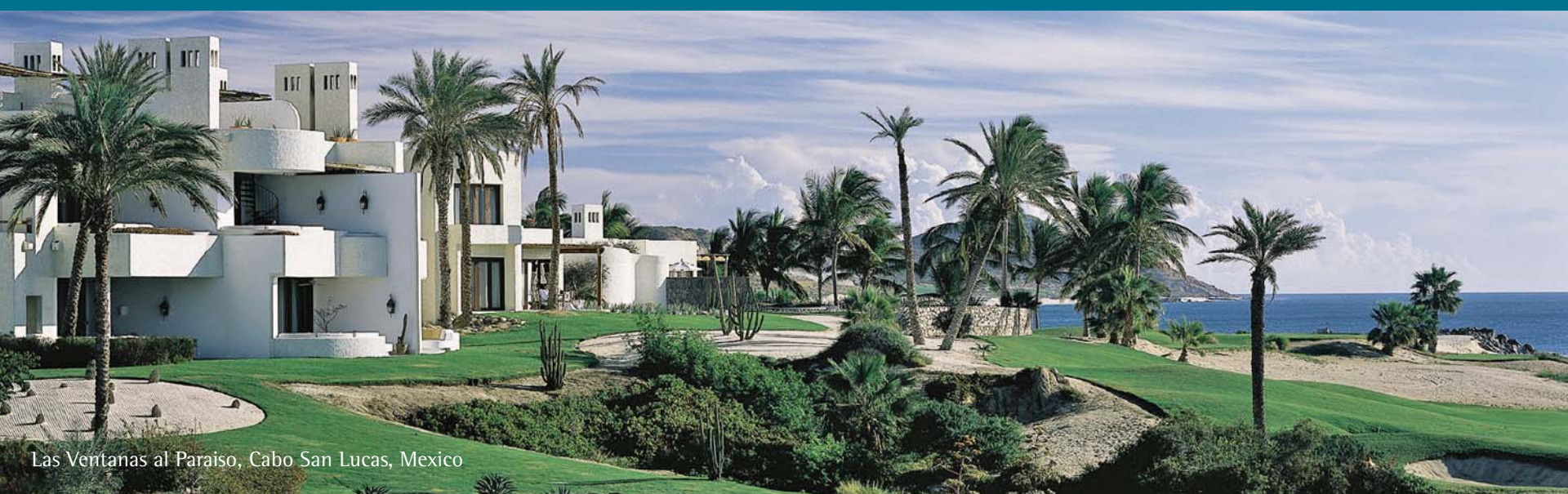
Las Ventanas al Paraiso, Cabo San Lucas, Mexico