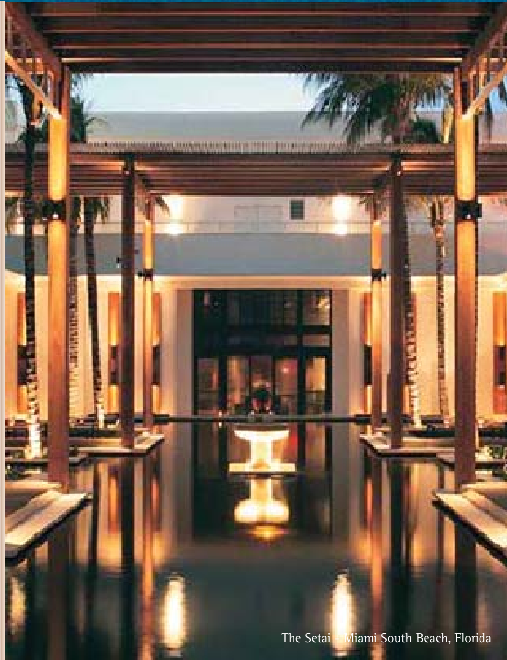
The Setai - Miami South Beach, Florida